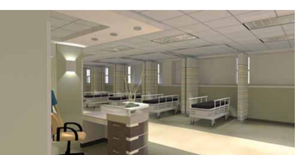
Proposed patient area PACU.