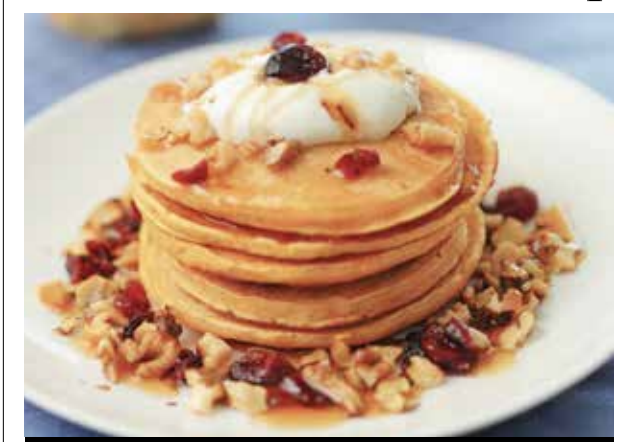
Yields: 4 servings (2 pancakes per serving)